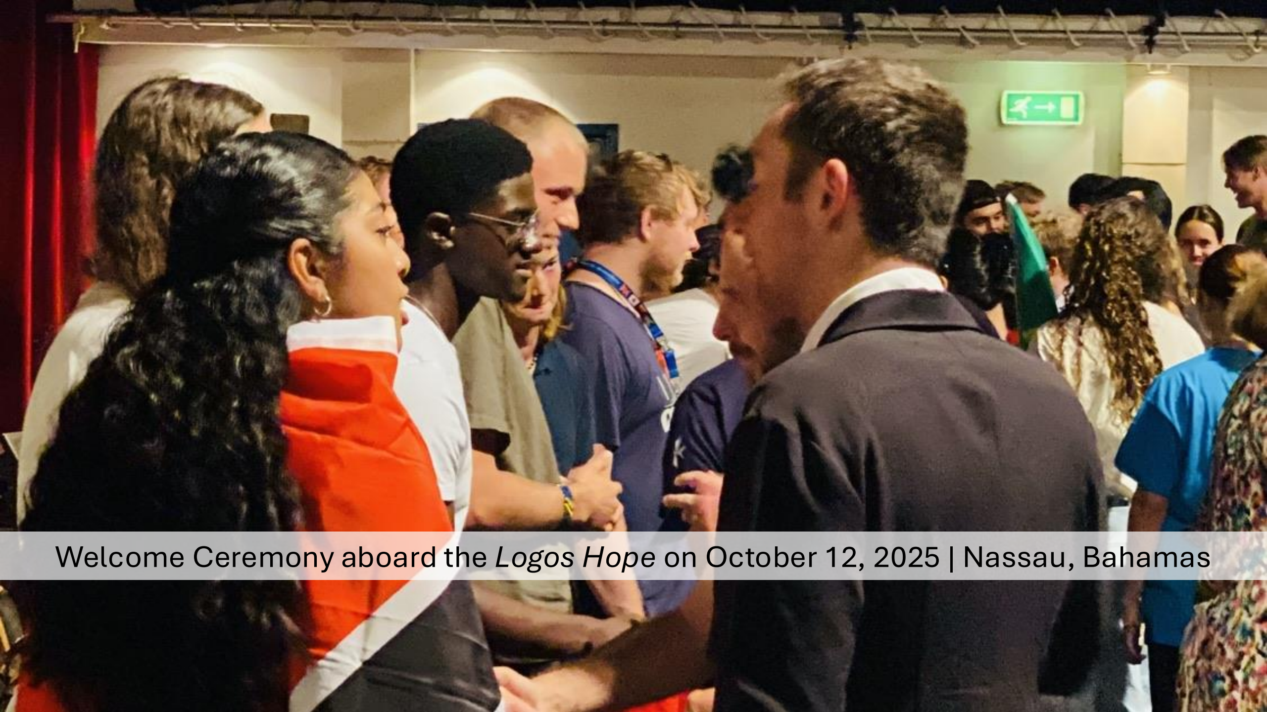
Welcome Ceremony aboard the Logos Hope on October 12, 2025 | Nassau, Bahamas